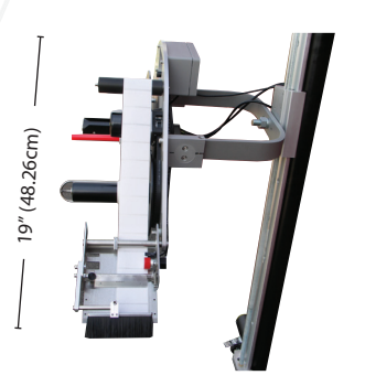
—— 23" (58.42cm)